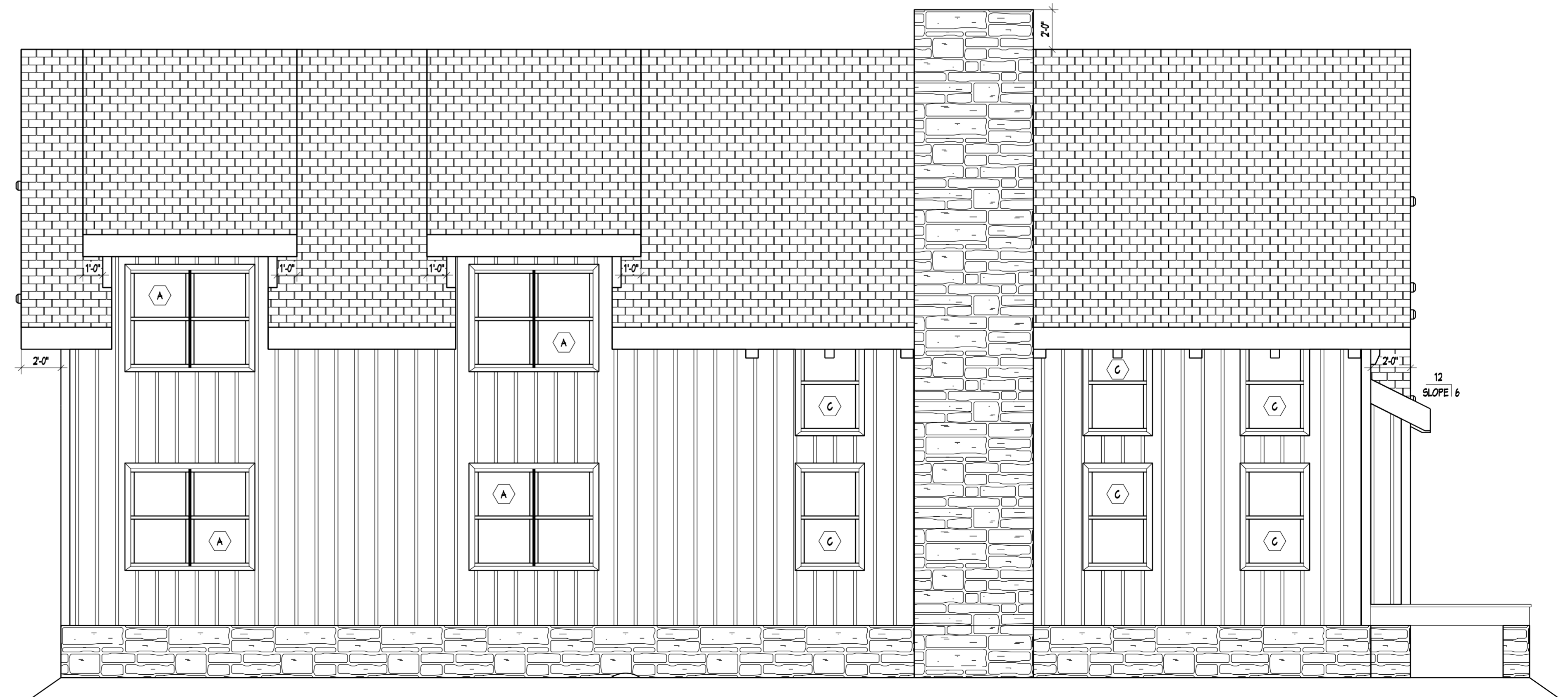
B A-202 PLAN LEFT ELEVATION SCALE: 1/4"=1'-0"

NOTE: STAIRS AND PROTECTIVE RAILING TO BE DESIGNED AND LOCATED BY OTHERS.