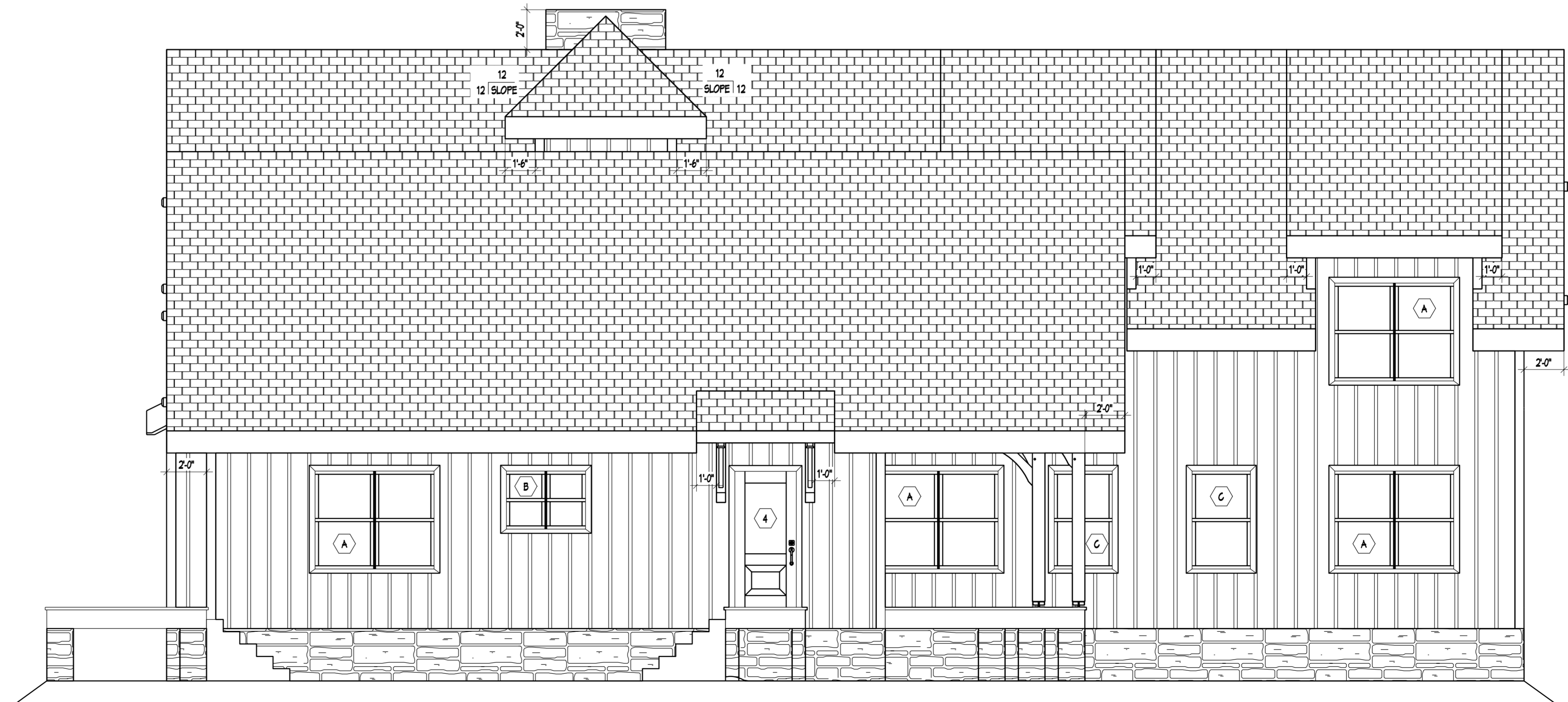
B A-201 PLAN RIGHT ELEVATION SCALE: 1/4"=1'-0"

NOTE: STAIRS AND PROTECTIVE RAILINGS TO BE DESIGNED AND LOCATED BY OTHERS.