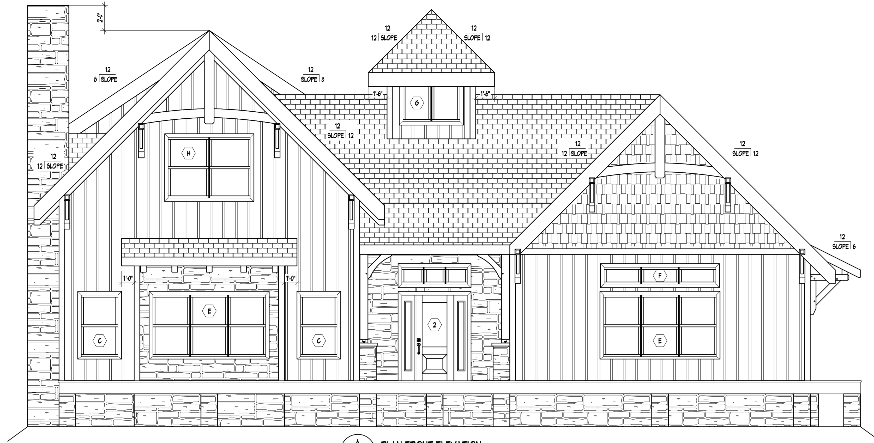
A A-201 PLAN FRONT ELEVATION SCALE: 1/4"=1'-0"

NOTE: STAIRS AND PROTECTIVE RAILINGS TO BE DESIGNED AND LOCATED BY OTHERS.